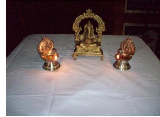
Honoured at beginning of ceremonies, Lord Ganesha is revered as Remover of Obstacles, Lord of Beginnings and Deva of intellect and wisdom