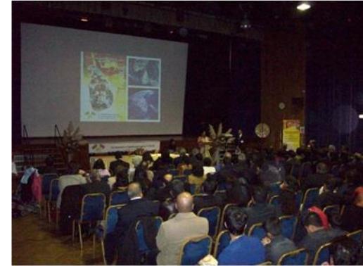
Part of the 150+ capacity audience with the 'We Sri Lanka' backdrop