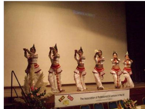
Pooja Dance - a devotional dance venerating Lord Buddha and the Gods