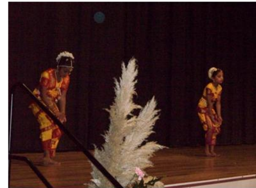
Bharatha Natyam dance depicting the blossoming of the lotus - uplifting the spiritual energy of the dancers, as well as their audience

Reconnecting & Rebuilding for Reconciliation